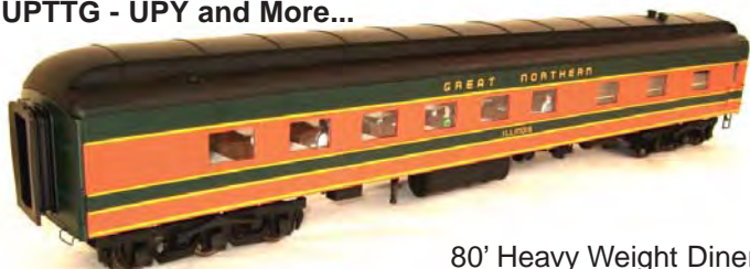
80' Heavy Weight Diner