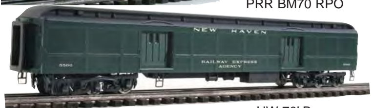
HW 70' Baggage