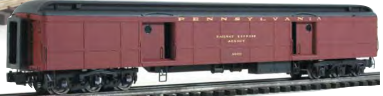
PRR B70 Baggage